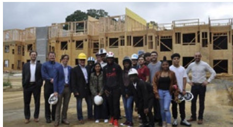
Trenton high schoolers visit Sharbell worksite.

While the successful passage of the bond initiative will provide the resources necessary for training the next generation of workers, NJBA and our local affiliates continue to build upon my initiative to help address the growing labor shortage in NJ. Though builders face labor shortages, nearly 17,000 students who wished to attend vocational or technical school in NJ were turned away last year due to space constraints.